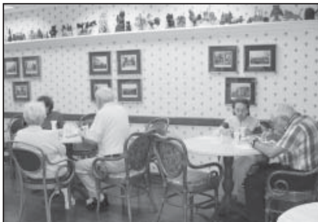
Residents enjoy a complimentary breakfast buffet and catch up on the local news in the Doorstop Café each morning.